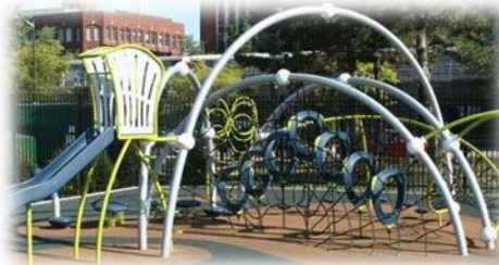
FREE Splash Pad & Playground