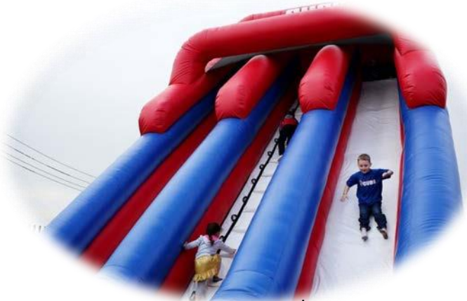
Toyota Funzone wristbands $5.00 unlimited play